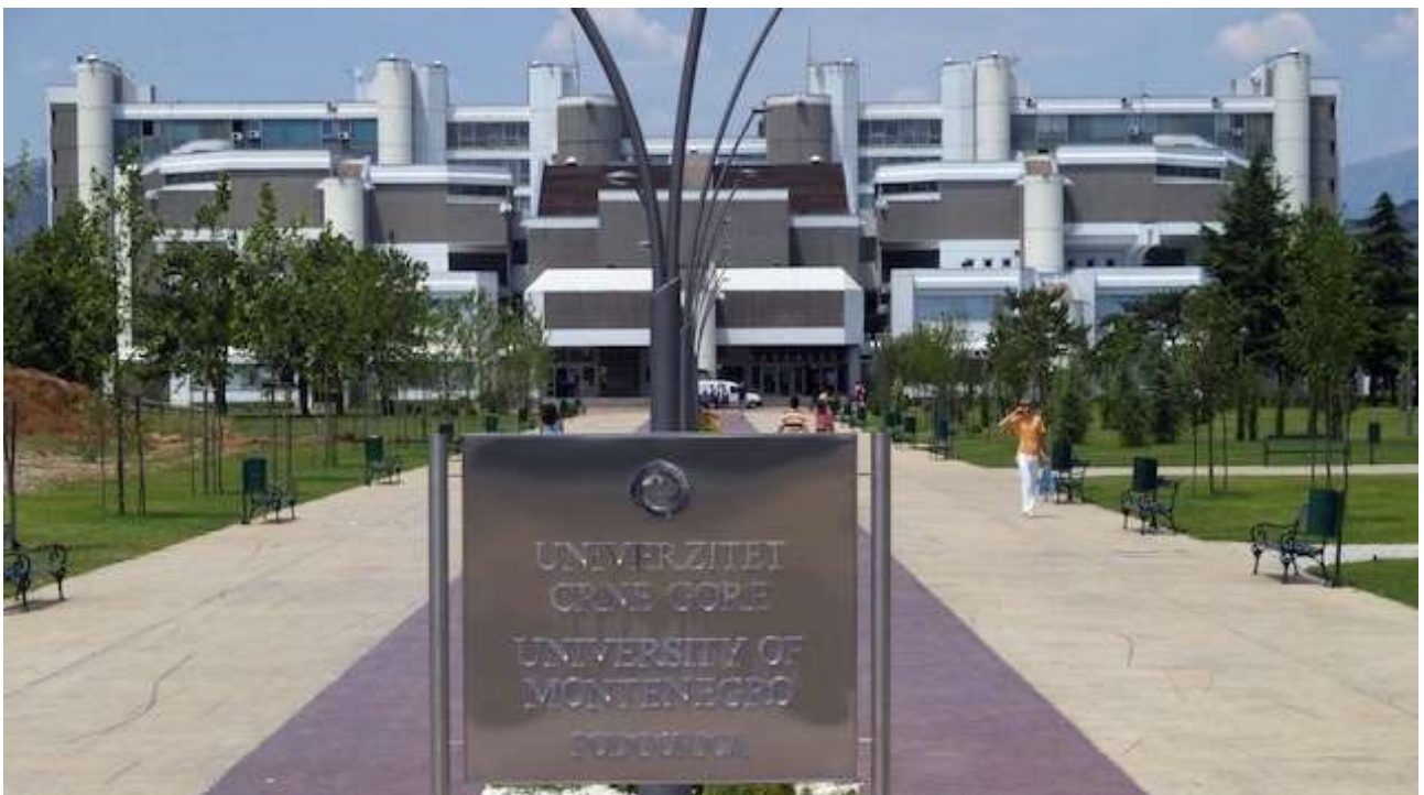
Location of Training venue for both days (main entrance)